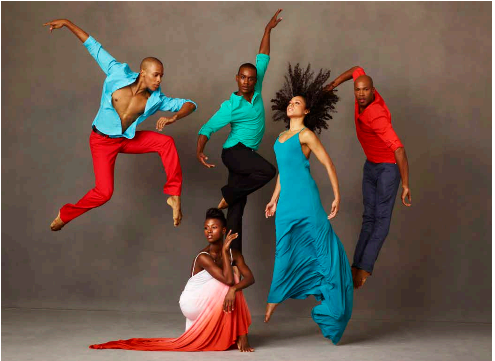
Alvin Ailey American Dance Theater