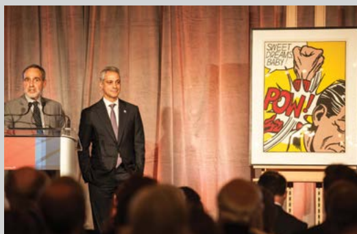
Chicago mayor Rahm Emanuel and Sotheby's auctioneer at an auction for the School of the Art Institute of Chicago