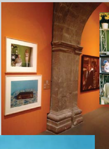
Conversations: Photographs from the Bank of America Collection at the Antigo Colegio de San Ildefonso, Mexico City