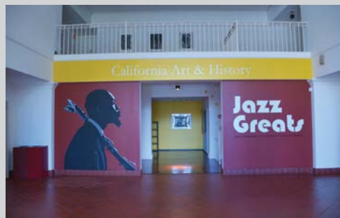
Jazz Greats: Classic Photographs, Works from the Bank of America Collection at the de Saisset Museum, Santa Clara University, California

Scheduled exhibitions include Modern Masters: Group f/64, Ansel Adams • Imogen Cunningham • Willard Van Dyke • Brett Weston • Edward Weston , at the Northwest Museum of Arts & Culture, Spokane (October 6, 2018 – February 3, 2019); Luces y Sombras: Images of Mexico at the El Paso Museum of Art (May 24 – September 8, 2019); In a New Light: American Impressionism 1870 – 1940 at the Heckscher Museum of Art, Huntington, New York (May 25 – August 18, 2019); and Science in Motion at the McClung Museum of Natural History & Culture, Knoxville, Tennessee (September 20, 2019 – January 5, 2020).