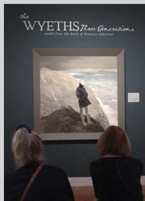
© 2018 Andrew Wyeth / Artists Rights Society (ARS), New York