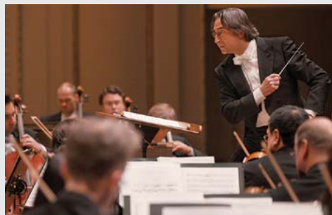
Chicago Symphony Orchestra