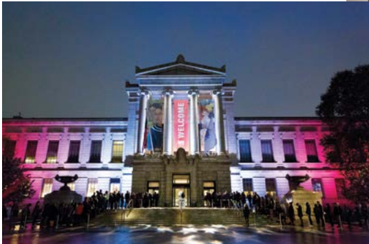
Museum of Fine Arts, Boston