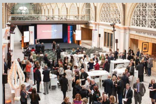
Auction in San Francisco to benefit San Francisco General Hospital and Trauma Center