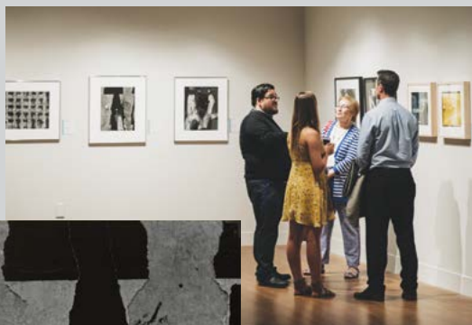
Moment in Time: A Legacy of Photographs, Works from the Bank of America Collection at the Museum of Photographic Arts (MOPA), San Diego