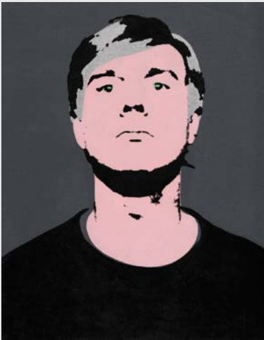
The Whitney Museum of American Art, New York Andy Warhol – From A to B and Back Again Andy Warhol (American, 1928 – 1987) Self-Portrait , 1964 Acrylic and silkscreen ink on linen The Art Institute of Chicago Gift of Edlis/Neeson Collection, 2015.126

© 2018 The Andy Warhol Foundation for the Visual Arts, Inc. / Artists Rights Society (ARS) New York