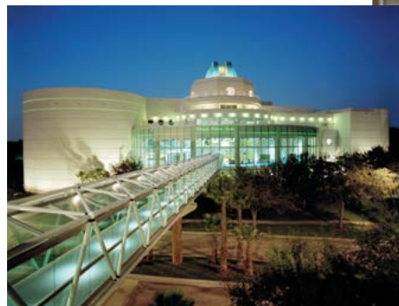
Orlando Science Center