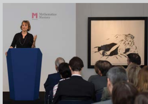
Auction in London to benefit Ark's Mathematics Mastery Program