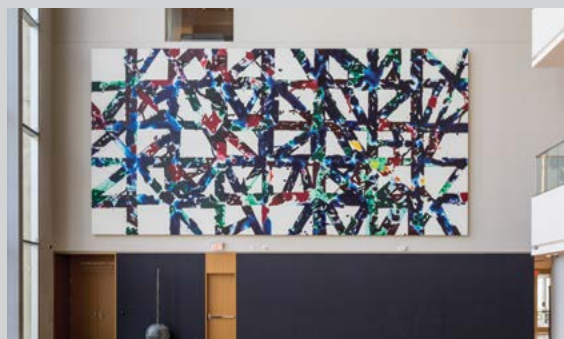
© 2018 Sam Francis Foundation, California / Artists Rights Society (ARS), NY.