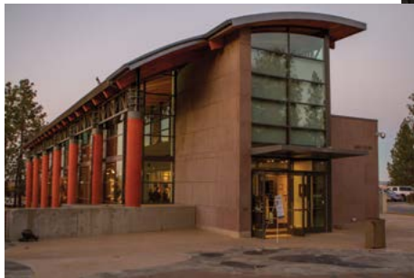
Northwest Museum of Arts & Culture, Spokane